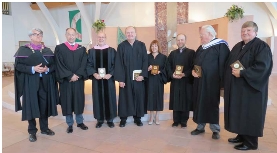
Special award recipients