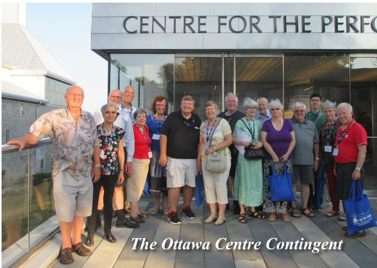
The Ottawa Centre Contingent