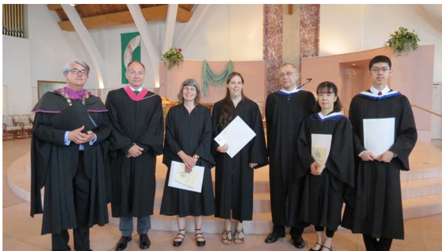
Diploma and certificate recipients