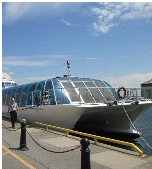
Our steed for the exceptional Thousand Island Luncheon cruise

CELEBRATING THE ORGAN IN HISTORIC KINGSTON, ONTARIO